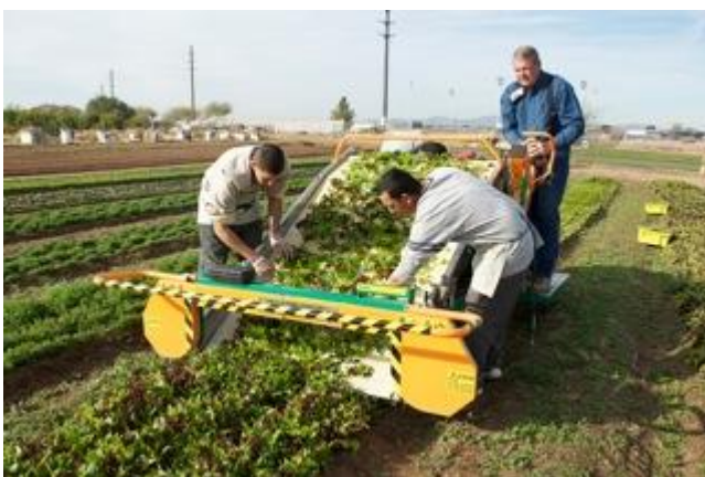
Removing weeds and defective leaves during Harvest.