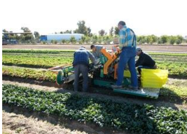
2nd man on platform unloads full Totes.