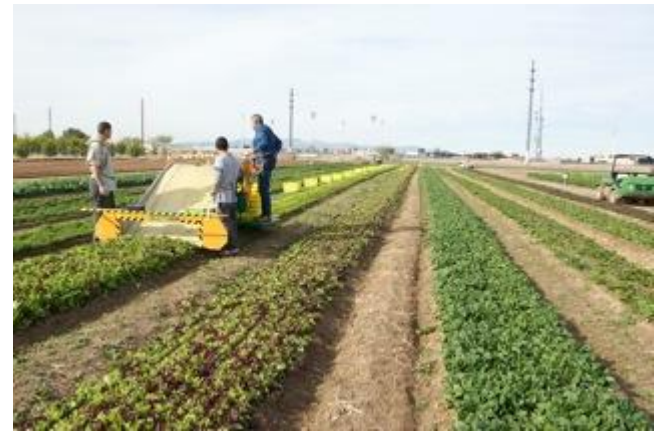
42 inch wide stands of greens on 350 foot long beds.