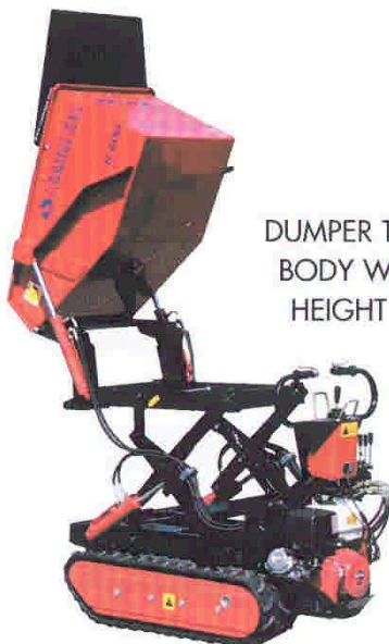
DUMPER TYPE LOADING BODY WITH VARIABLE HEIGHT DISCHARGE