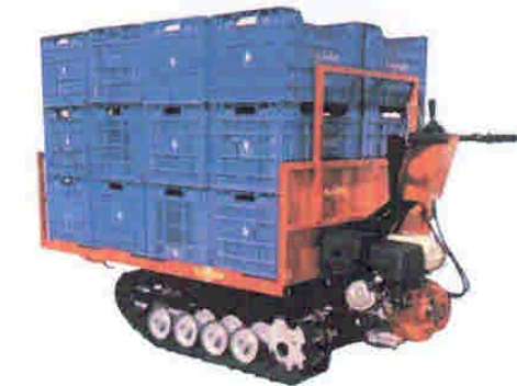
GRAPE AND ORANGE LUG CARRIER

Those planning high density cropping systems and those who farm slopes or terraces should look closely at the Rotair system before trying to solve mechanization problems with conventional tractor implements. The basic tracked power unit costs $15,000.