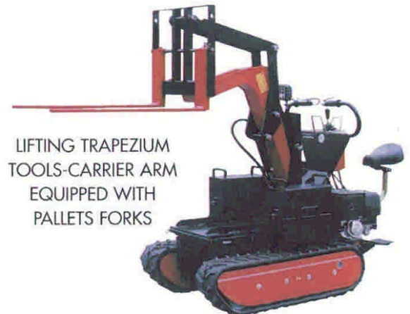
LIFTING TRAPEZIUM TOOLS-CARRIER ARM EQUIPPED WITH PALLET FORKS