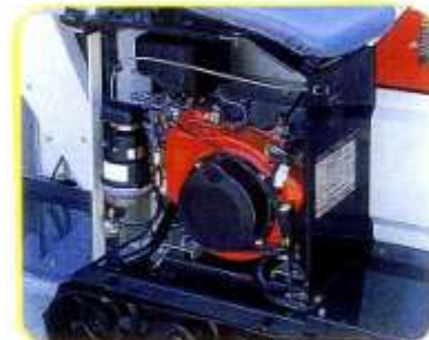
10 hp Gas 4 cycle Engine

Priced Currently at $28,000 Fob Portland, Oregon