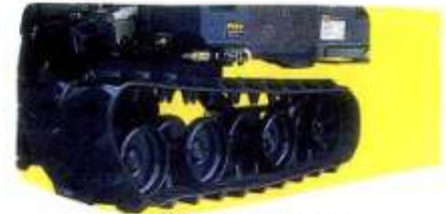
Rubber Tracks Stability