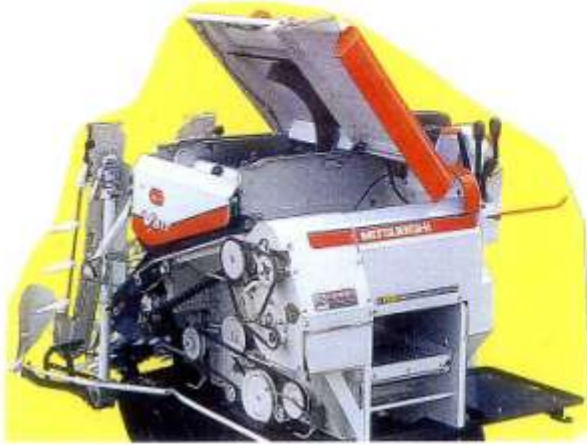
Open Access Easy Clean out