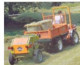
One of several small round balers that can be operated behind small 20 HP transporters or tractors.