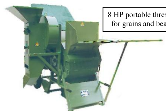
8 HP portable thresher for grains and beans