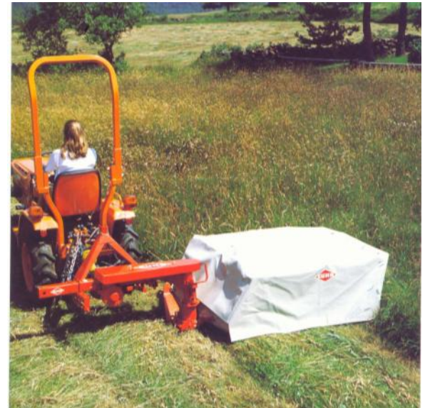
21 HP tractor cutting hay with disc mower.