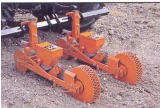
Even smallest tractor can operate precision belt planters each metering unit can put down 1 to 3 lines of seed. Precise spacing minimal doubles mean less thinning and easier tillage.