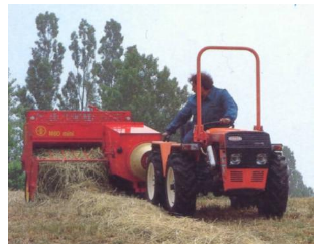
25 HP Trattorini powering a small square baler to produce 60+ pound bales of hay.