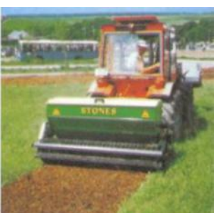
Bury stones and debris with models as narrow as 34" with tractors from 15 HP - 20 HP. Ideal seed bed preparation

For the Market gardener an ideal system consists of growing beds alternating with slightly wider strips of turf. The sod keeps growing area accessible even after rain or irrigation and supports tractor tires avoiding ruts. Tractor straddles growing beds without compacting them. Turf strips slightly wider than tractor tires are easily maintained by tractor mounted mowers. CSAS, you pick farms and farms with on site stands benefit as well from attractiveness of such a growing system.