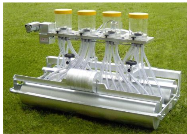
Bassi Seed Spider plants high density greens.

The Trattorini's versatility extends to field crops such as hay and grain as well as permacultures such as vineyards, orchards, and woodlots. Appropriately sized implements aid proper establishment and harvesting of these diverse crops.