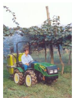
26 HP Ferrari Vipar crop protection shown applying bordeaux mix on grapes.