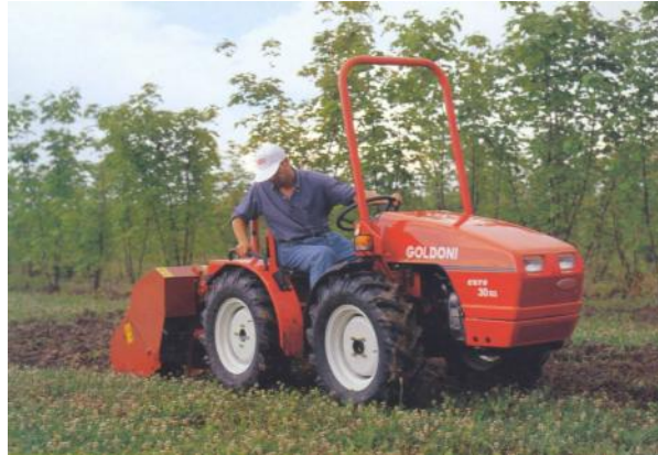
26 HP Goldoni spading in a cover crop. There is no better tillage system, models from just 31" wide.