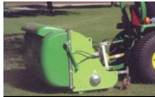
48" wide flail mower with Collector. Mow strips between beds and collect material for compost.