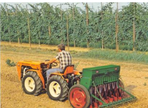
21 HP Tractor drilling hay, grain or cover crop.

The Trattorini's versatility extends to field crops such as hay and grain as well as permacultures such as vineyards, orchards, and woodlots. Appropriately sized implements aid proper establishment and harvesting of these diverse crops.