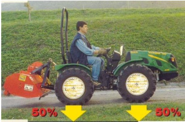
Ferrari Vipar 26 HP with 59" flail mower.

In Italy where small scale enterprises, be they industrial or agricultural, are the rule, they use the term "Trattorini" of the smallest farm tractors. These are not glorified lawn mowers found at U.S. mass marketers but are farm tractors with dimensions and horsepower appropriate to smaller scale and diversified farming operations. They become fully functional because they have standardized 3 pt. systems and PTO's and can be equipped with a large array of implements for land preparation, fertilizing, seeding, transplanting, cultivating, spraying, harvesting, shredding and cover cropping.