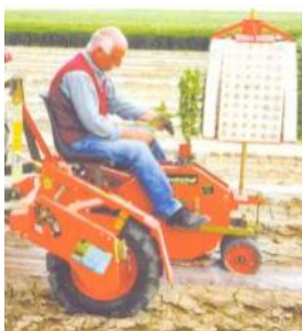
Transplant seedlings or soil blocks or bulbs with 20 HP.