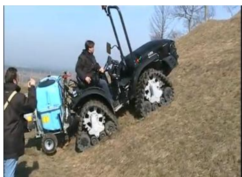
New Antonio Carraro 87 HP Mach 4 Crawler