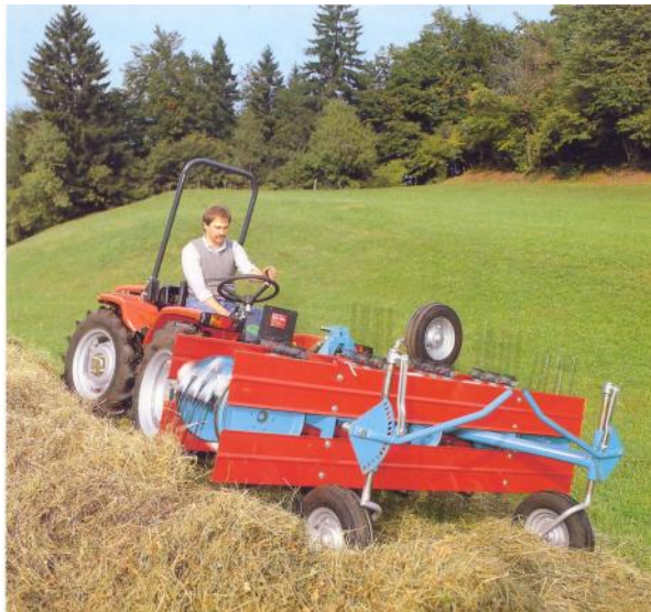
Belt Rake AC Tigrone 48 HP