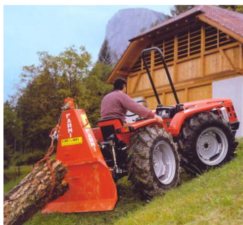
Logging Winch AC Tigrone 63 HP