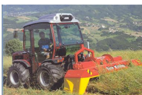
Drum Mower AC TTR 68 HP