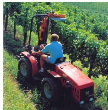
Hedging Tool AC Supertigre 48 HP