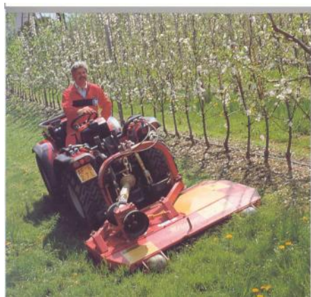
Rotary Mower AC SRX 68 HP