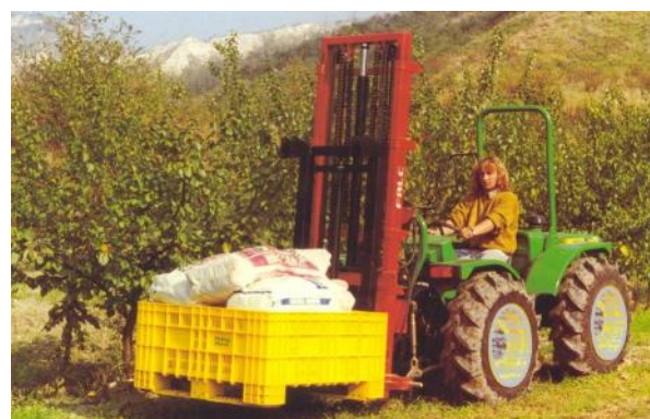
Forklift Ferrari 68 HP