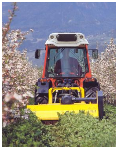
Flail Mower AC TRX 68 HP