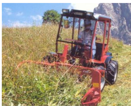
Double Sickle AC HST 38 HP