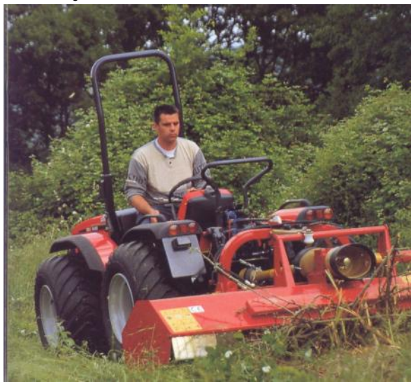
Antonio Carraro TRX-8400 (68HP)