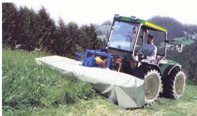
Drum Mower Ferrari 68 HP