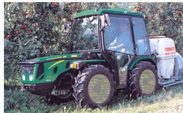
Air Blast Sprayer Ferrari 35 HP