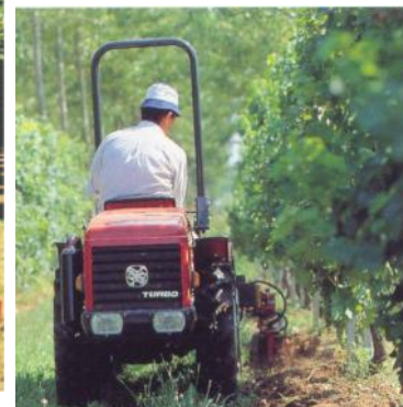
Grape Hoe AC Supertigre 48 HP