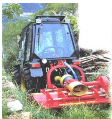
Flail Mower Ferrari 46 HP

Give Ferrari tractor CIE a call at (530) 846-6401 or FAX (530) 846-0390 for details on a model to fit your application. We have supplied this technology since 1990.