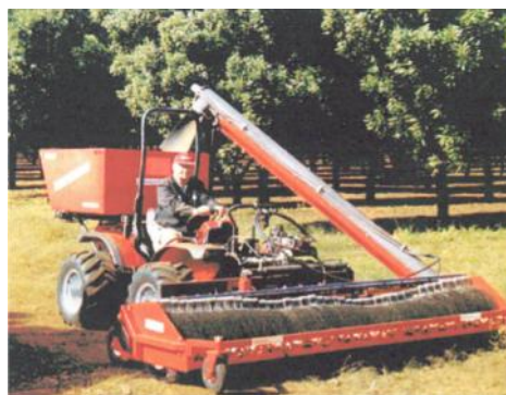
Nut Harvester AC SRX 8400 68 HP