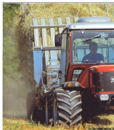
Loose Hay Loader AC TTR 83 HP